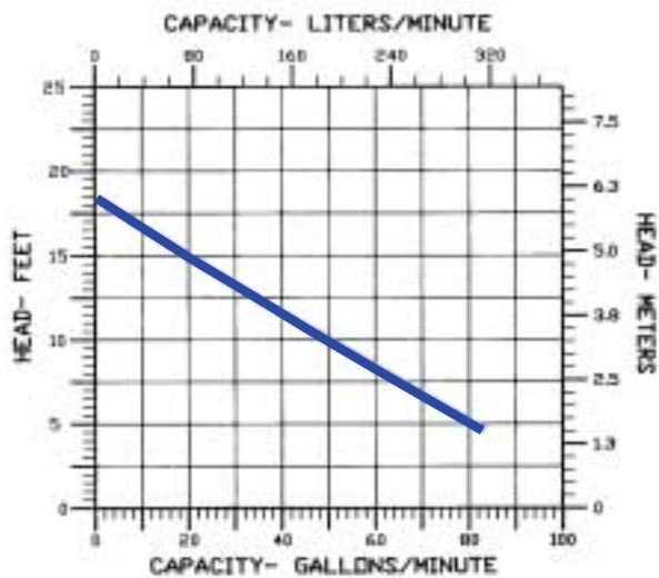
PUMP PERFORMANCE CURVE